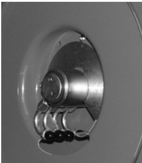
"Goose-necks" plus integral ramp assure smooth hose transition between manifold and reel spool.